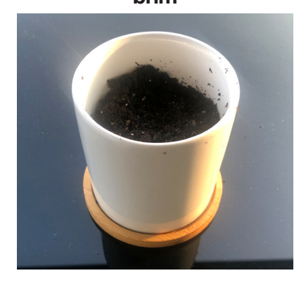
Step Three - Cover Seeds in 1/4 inch of soil