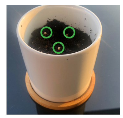
Step Four - Dampen soil with water